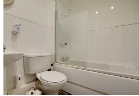
Bathroom Residents Parking